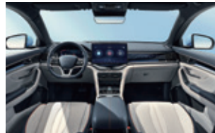
Blue and grey